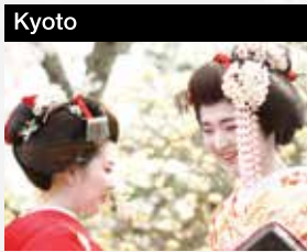
Gion Geisha District