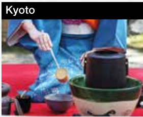
Green Tea Ceremony