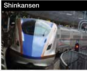
Bullet Train Ride