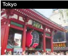
Asakusa Senso-ji Temple