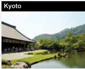
Tenryuji Temple Zen Garden