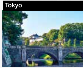
Tokyo Imperial Palace