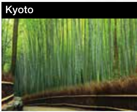
Arashiyama Bamboo Grove