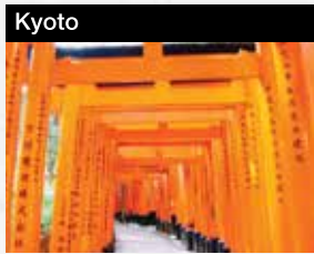
Fushimi Inari Shrine