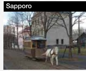
Historic Village of Hokkaido