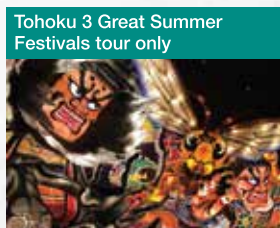
Tohoku 3 Great Summer Festivals tour only