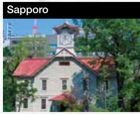
Sapporo Clock Tower