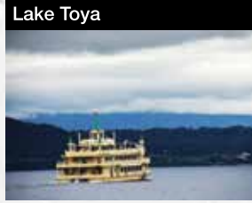
Mt. Usu (Usuzan)