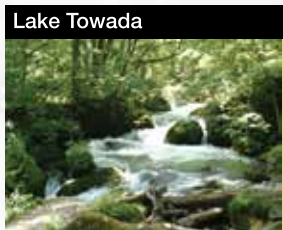
Oirase Mountain Stream