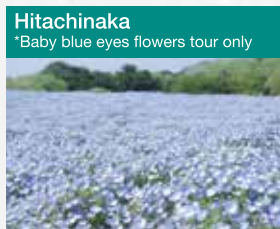
Hitachinaka *Baby blue eyes flowers tour only