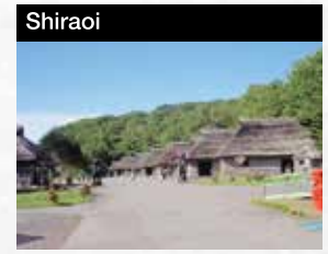
Shiraoi Poroko Kotan