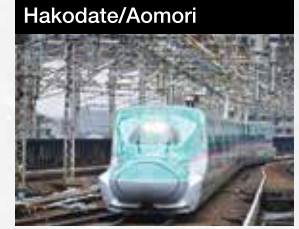
Seikan Undersea Tunnel